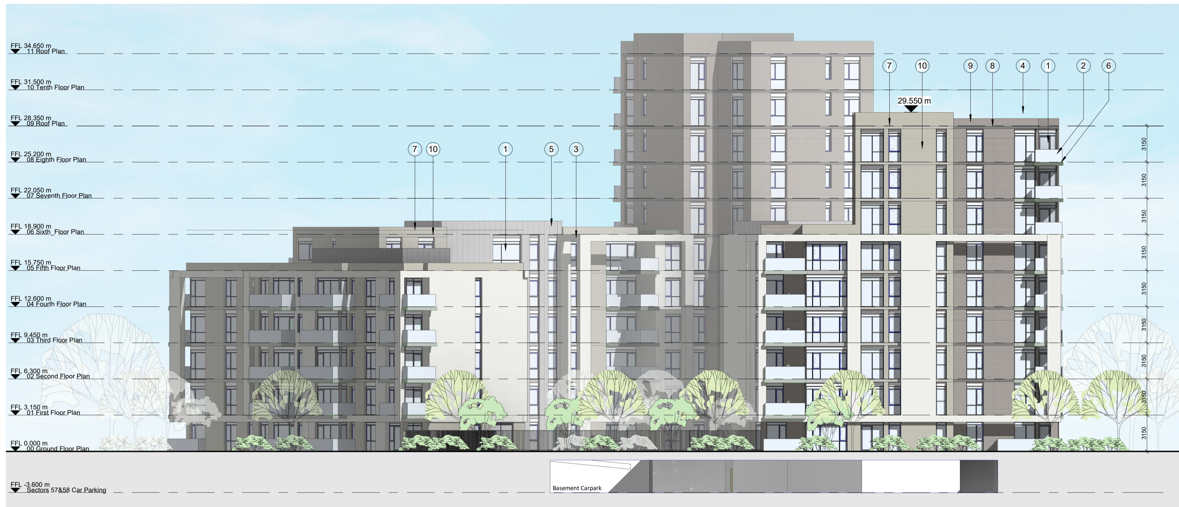
Block 8B Elevation 3