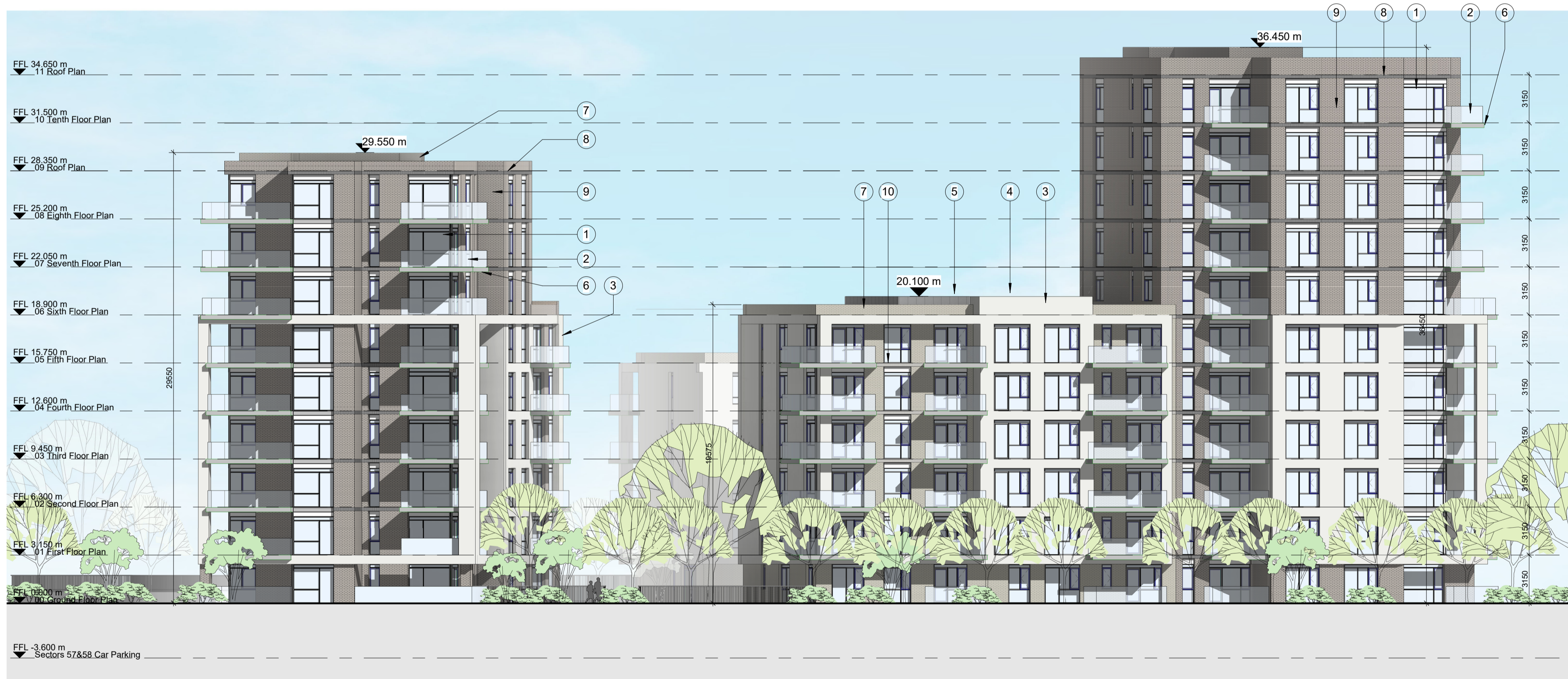
Block 8B Elevation 4